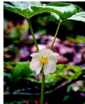
Pretty spring blooms are poisonous.

April 22nd is Earth Day and Friends of Forest Hill Park will be in the park that day removing invasive plants that are choking out our native plants, shrubs and trees. Bring gloves and clippers and join us from 9:00—noon for a few minutes or the whole time in the 3800 block of Forest Hill Avenue near the old Stone Pyramid. Bottled water and snacks will be provided. Come be a Friend of Forest Hill Park.