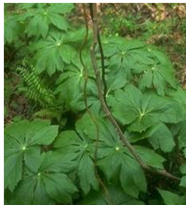
Mayapple foliage is shaped like umbrellas.